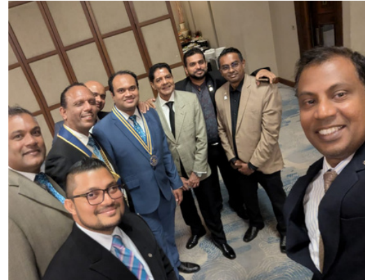
Ja Ela - Kandana 31-Aug-2025