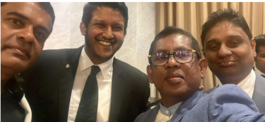
Colombo Regency 29-Aug-2025