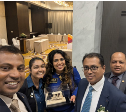
ICinnamon Gardens 07-Aug-2025

Last month, the Rotary Club of Colombo Centennial took part in several installation ceremonies, proudly showing our support for the new presidents and building stronger bonds with fellow clubs.