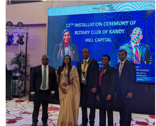
Kandy Hill Capital 09-Aug-2025