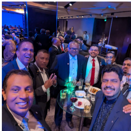
Colombo Mid Town 27-Aug-2025